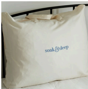
White cotton large storage bag