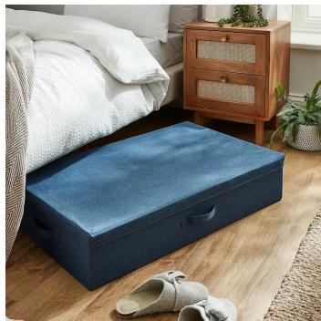
Fabric Underbed Storage Box