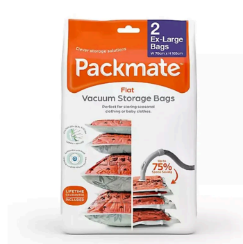
2 Packmate Extra Large Flat Vacuum Bags